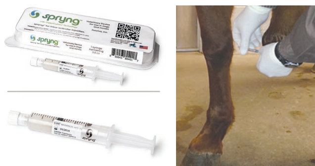
FIGURE 3: Packaged syringe containing 2 cc Spryng, and an example of intra-articular administration to a horse.